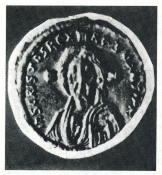
Fig. 1: Justinian II coin.