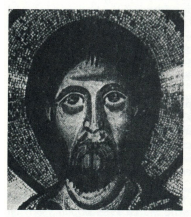
Fig. 2: Head of Christ, mosaic, Church of Santa Sophia, Salonica.