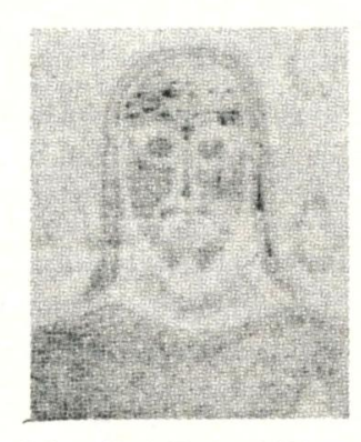
Moncalieri, Turin, 1634