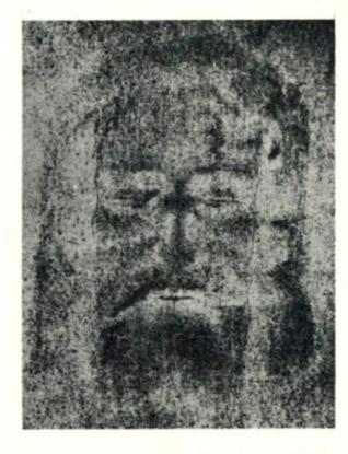
Cussetti copy, Turin, 1889