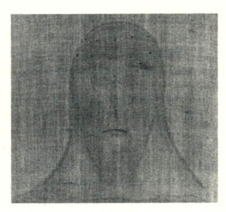
Summit, New Jersey, 1624