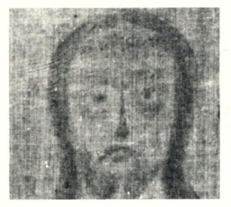
Lierre, Belgium, 1516