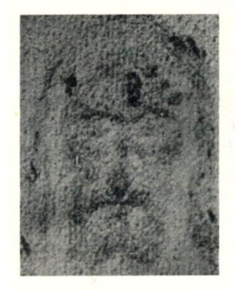
Reffo copy, Turin, 1898