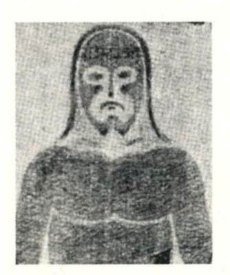
Chambéry, France, XVII<sup>th</sup> c.