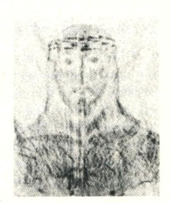
Acireale, Italy, 1644