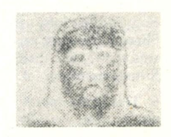
Bologna, Italy, mid-XVII<sup>th</sup> c.