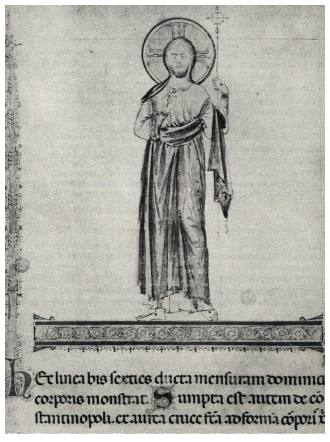
Fig. 2: The Mensura Christi parchment of the XII<sup>th</sup> century. Codex III, Pluteus XXV, Laurentian Library, Florence.

Now why did Justinian send his envoys to Jerusalem to measure the height of Christ if the Shroud was in Edessa, folded inside a frame and showing only the Face?