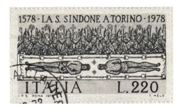
Fig. 1: The commemorative stamp of 1978. Enlarged 130%.

eleven Prelates, wearing copes and mitres, hold up the Shroud for the public to see. Above the head of each Prelate is written the locality of his residence or his name. In a row behind the Prelates, conveniently visible between their heads, eleven ecclesiastics are represented, wearing liturgical garments and holding the crosiers, crosses and candles.