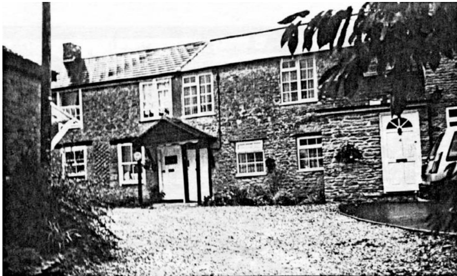
THE TERRACE OF THREE COTTAGES IN TEMPLECOMBE, SOMERSET, IN THE REAR OF WHICH (THE ONE ON THE RIGHT) MRS MOLLY DREW MADE THE STARTLING DISCOVERY IN 1944 OF THE PANEL PAINTING COPIED FROM THE SHROUD