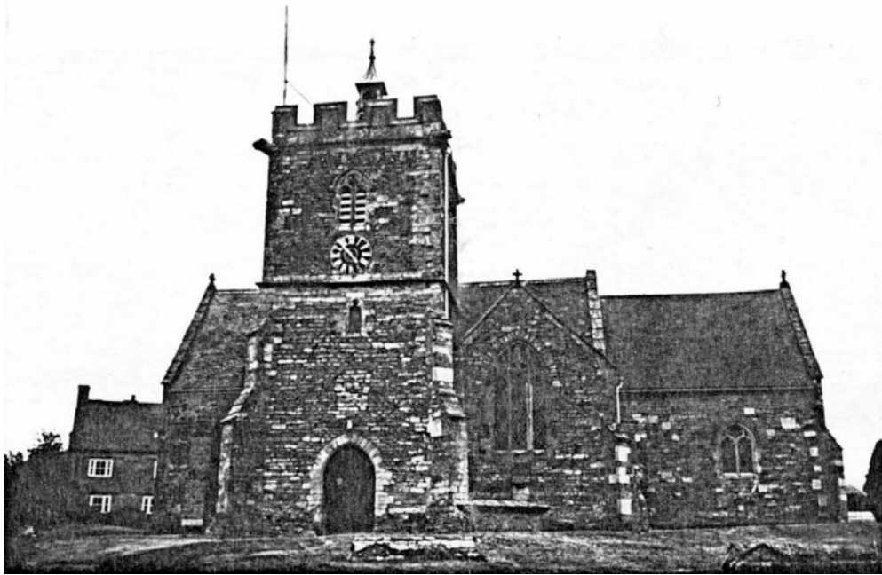
ST MARY'S CHURCH, TEMPLECOMBE, SOMERSET, WHICH HOUSES THE PANEL