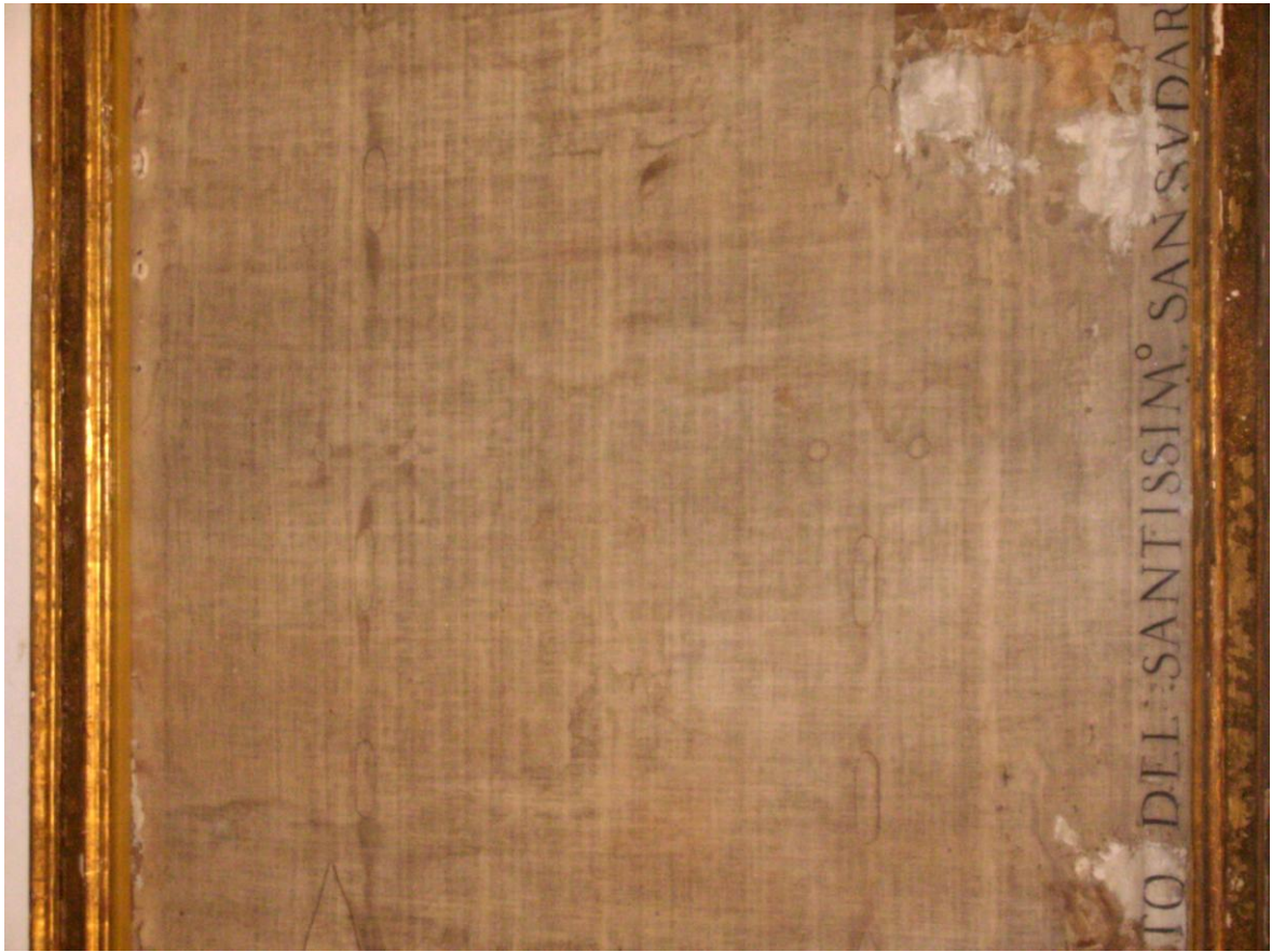
The Shroud of Rabat Image Detail