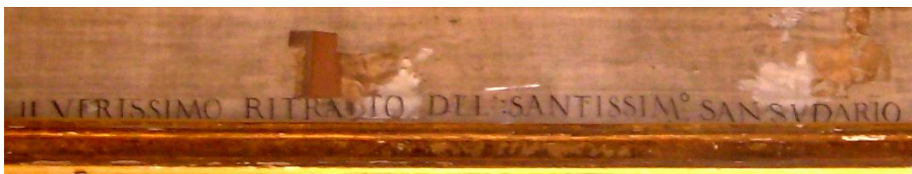
Closeup of Inscription - Contrast slightly enhanced