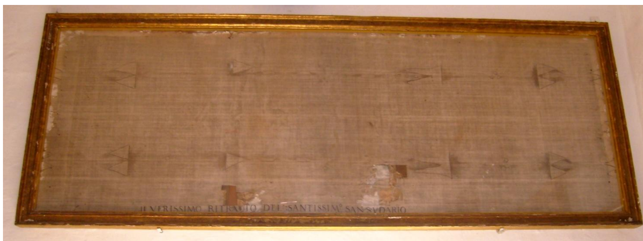
The Shroud of Rabat, Malta