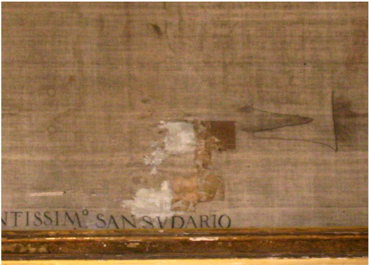
The Shroud of Rabat Damage Detail Photographs