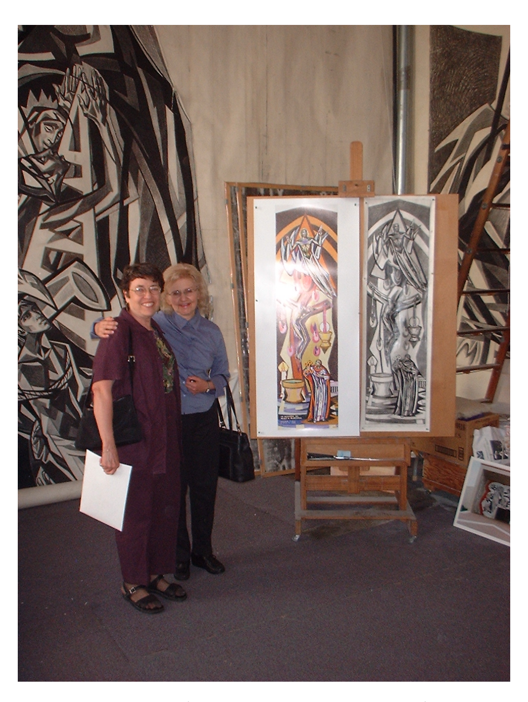
Piczek Studio (photo by P. C. Maloney, Sept. 19, 2005)