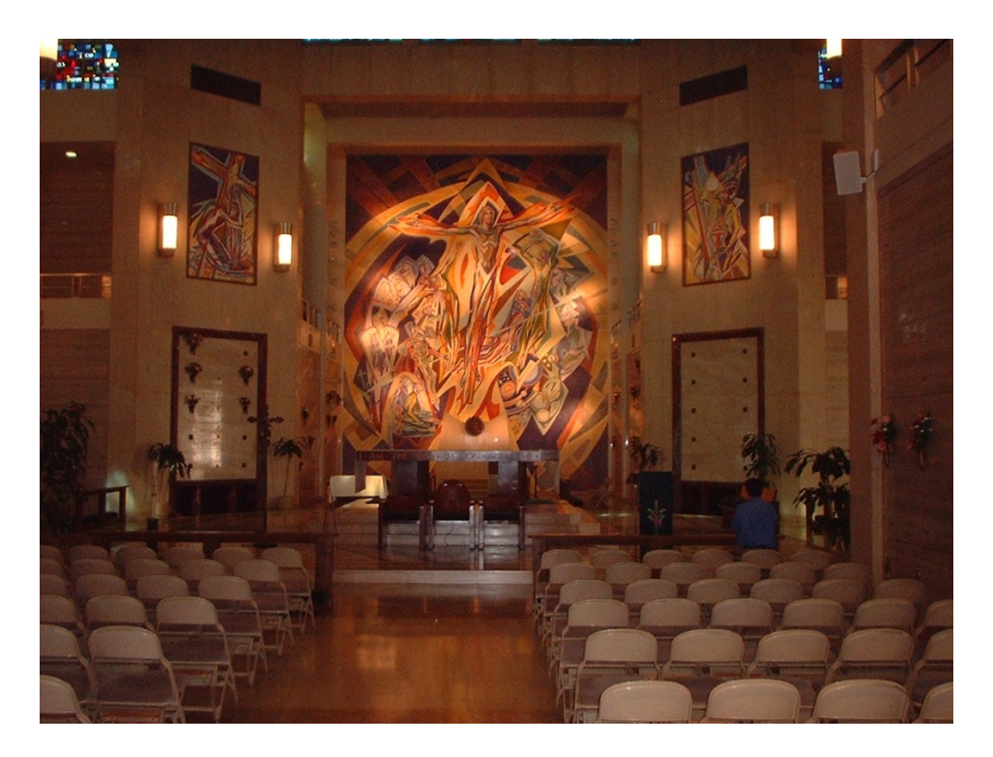
The chapel in the Holy Cross Cemetery, Culver City, CA