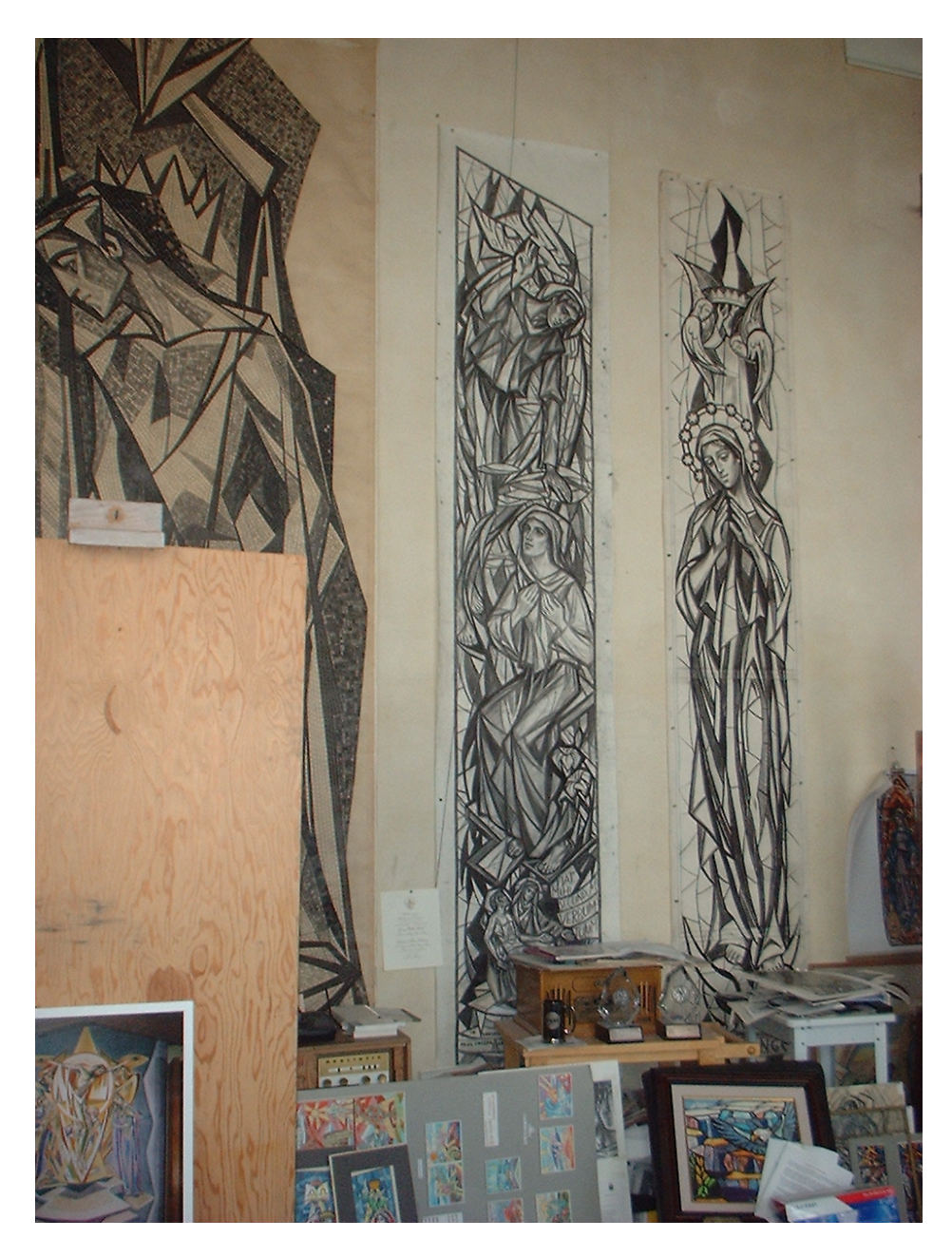
Piczek Studio, Los Angeles, CA