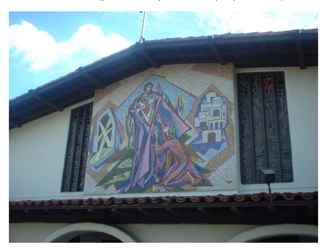
Camarillo, California (photo taken by P. C. Maloney, Sept. 17, 2005)