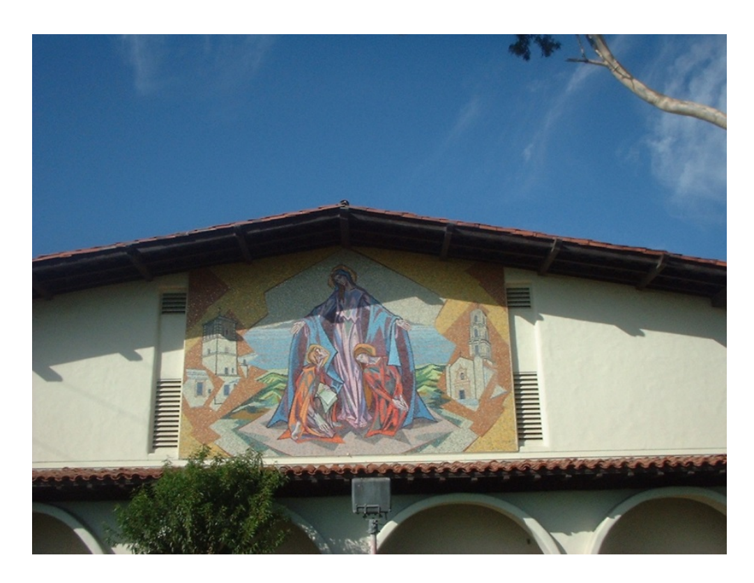
Camarillo, CA (photo taken by P. C. Maloney, Sept. 17, 2005)