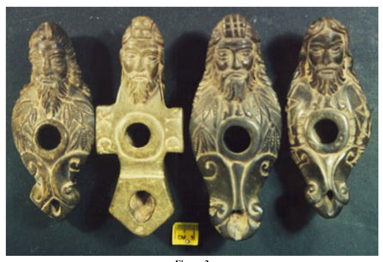
Figure 3 Four carved stone oil lamps, allegedly found in an archaeological site in Syria allegedly dated to c. A.D. 200. The faces are significantly related to the Shroud face.