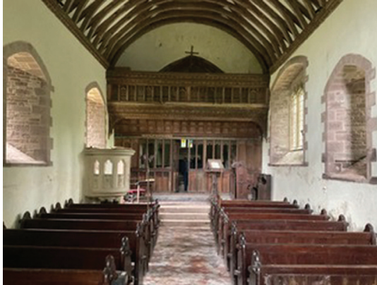
Llangwm Uchaf, Monmouthshire, Rood Screen © Val Willie

This not only acted as entrance to the chancel, but was also surmounted by a loft: from the loft the gospel was read when the Mass was celebrated. Access to the loft was from a winding stone staircase still found in many mediaeval churches, including St Woolos, though the loft, screen, rod and crucifix, themselves, actually survive in far fewer.