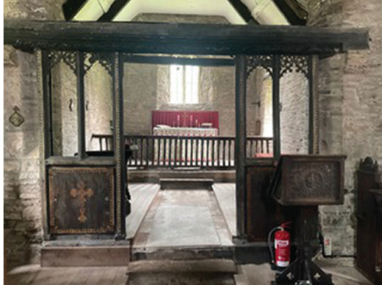
Gwernesney, Monmouthshire, Rood Screen

In the Middle Ages, the simple cross surmounted what was [and still is] known as the rood screen.