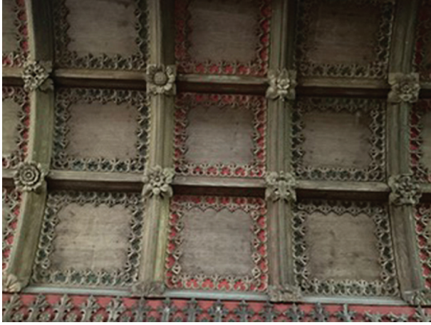
Detail from the underside of a Rood Screen, Llangwm Uchaf, Monmouthshire.

I am aware of a limitation to this article: I lack knowledge of all the places in Britain where large roods are found. Indeed, having such knowledge may have made this article overlong. I would be grateful, however, were readers to address my ignorance with any additional knowledge of their own. I am concerned, too, that of the places mentioned, only Coventry Cathedral has hosted the excellent Shroud Exhibition. I would love it to be otherwise.