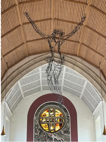
Corpus of wires and nails by Tay Swee Siong in front of artwork with stained glass by John Piper & Patrick Reyntiens.

Of six Anglican Cathedrals in Wales, three have individual roods in the shape of figures of Christ, life-size or larger. In Bangor Cathedral, a wooden figure is present, the Mostyn Christ 2 , dating from 1450 and given to the Cathedral 500 years later: the fact that parts of this sculpture are perfect and parts [the arms] damaged adds to the poignancy of the image. Cardiff's Llandaff Cathedral, remodelled by George Pace after bomb damage in the second world war, has at its centre a drum supported by splayed arches. On the drum is what seems a carved image of the ascending Christ 3 by Jacob Epstein, or is it one of His descending as Universal Judge. Though I have always seen it as the former, I have to admit that it could be both, and admit that as either it is unusual.