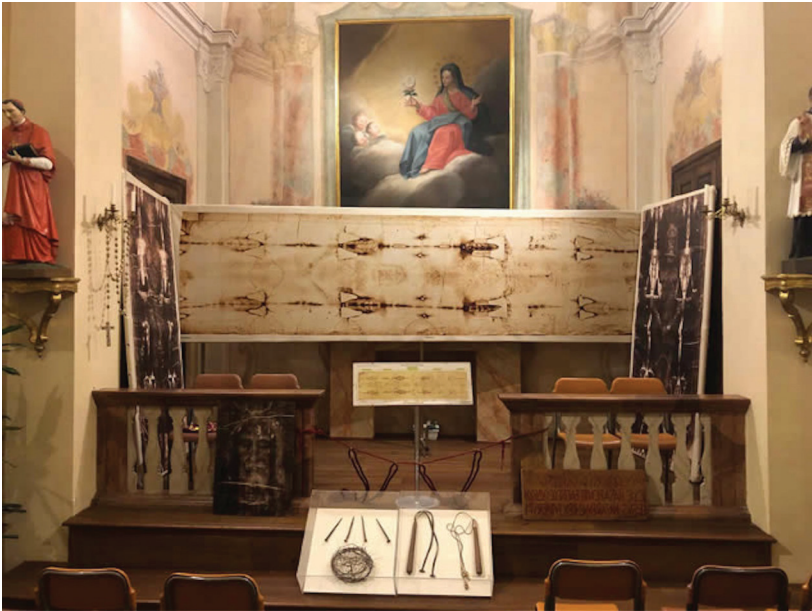
Chapel of Our Lady of the Rose, in the church of Sant’Alessandro Martire, Robbiate