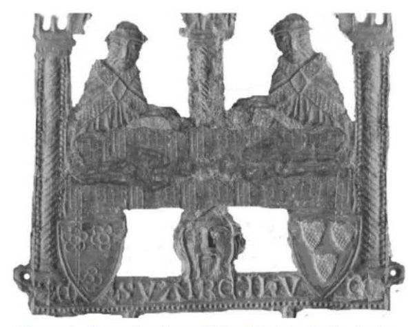
Figure 1: Reconstruction of the 'Machy' pilgrim badge, showing its inscription 'SVAIRE IhV. explicitly claiming the cloth as a genuine relic of Jesus

Readily indicative of some quick recognition of this inadvisability claim's whatever its truth - is the fact that no-one at Lirey, clerical or lay, seems to have made anv attempt to defend themselves or to explain to Bishop Henri how such a remarkable object had come into their care. Instead, as the later Bishop d'Arcis would attest, the Shroud was simply hidden away, like some guilty secret, for well over three decades.