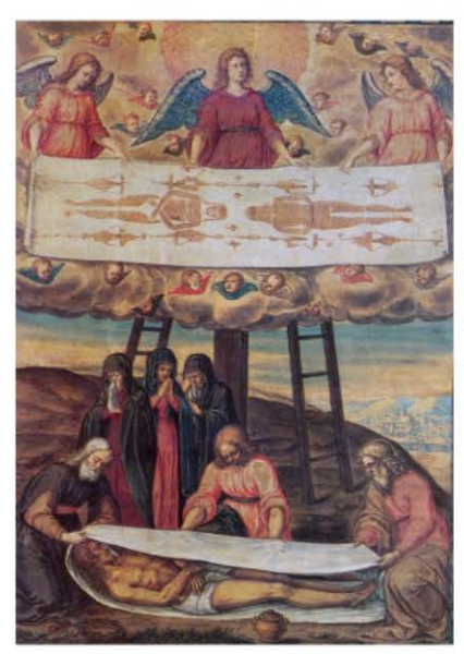
Figure 9: G.B. della Rovere aquatint depicting the Lamentation at the foot of the Cross, a scene descended from similar depictions by Byzantine artists half a millennium earlier. Galeria Sabauda, Turin