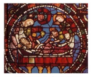
Figure 7: Stained glass window at Chartres, c.1150, depicting the post-Deposition Lamentation over Jesus' dead body by the Virgin Mary and

Rather more solid and substantial, however, is the fact that broadly synchronous with the time that we have postulated that the Image of Edessa/ Shroud quietly switched from was Constantinople Jerusalem. to certain developments that were arguably closely related to it occurred in literature and art, western and eastern. In literature western writers such as Ordericus Vitalis (c.1130), began referring to the Image of Edessa as bearing the full-length imprint of Jesus' body, not just a facial imprint as had hitherto been universally supposed. Likewise, in