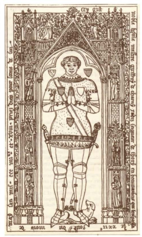
Figure 3: The effigy on Geoffroi II de Charny's now lost tombstone at the Cistercian abbey of Froidmont, showing the expensive full-body plate armour that he had apparently purchased for going on crusade. From a drawing in the Gaignières collection, Paris

Certainly, exactly such crusading, first in North Africa, then in eastern Europe, occupied the remaining years of Geoffroi II's life, his final, and ultimately fatal venture being the disastrous Nicopolis crusade of 1396. Though he was spared the beheadings suffered by many in the immediate aftermath of the crusaders' defeat, appalling Turkish prison conditions seem to have so seriously damaged his health that he died very shortly after returning to France in early 1398. Whereupon, because he left no son, Lirey and his other family