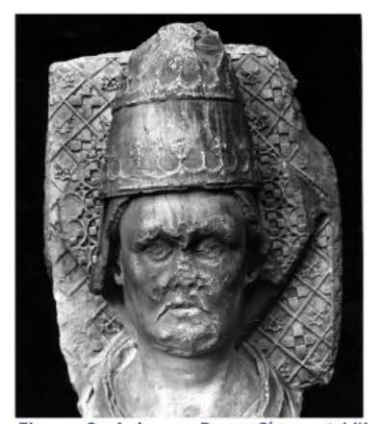
Figure 2: Avignon Pope Clement VII, whose permission Geoffroi II de Charny sought in order to show the Shroud merely as a 'picture or representation'.

Except that yet another puzzle, long a thorn in the flesh for proponents of the Shroud's authenticity, is that in making this application Geoffroi II described the Shroud, not as the genuine suaire of Christ, but simply as a 'picture or representation' of this that had been shown at the church decades earlier, and