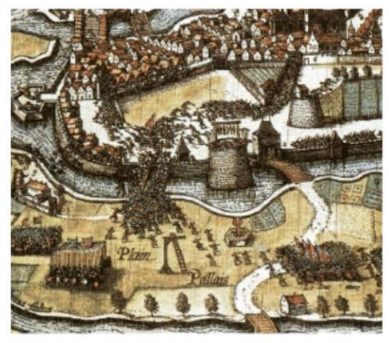
Figure 5 Geneva's Plainpalais, where Marguerite de Charny showed the Shroud in 1453, from an early view of Geneva

auspices, Charny help explain a great deal. Solely thanks to a surviving set of accounts it is now known that Marguerite de Charny - under the title Countess de Villars successfully staged a series of public and private showings of the Shroud in Duke Louis' city of Geneva during the Lent and Easter period of 1453, i.e. synchronous with her being in Geneva for signing the Act exchanging Varambon Miribel.<sup>12</sup> The accounts in question itemise the costs of scaffolding and other materials