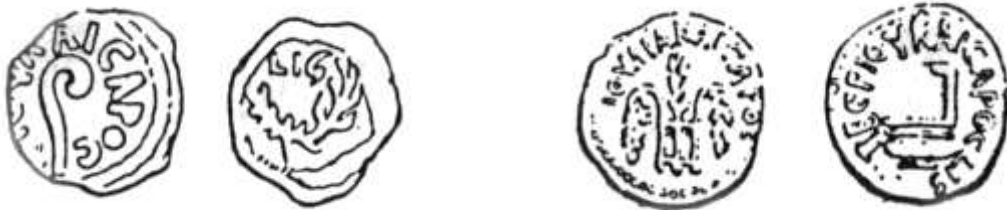
Pilate lituus dilepton Pilate barley ears dilepton

This paper is a particularly impressive presentation of the evidence for Fr. Francis Filas's famous "coins over the eyes" hypothesis, coming as it does from an extremely knowledgeable numismatist. Brame supports the Filas' view that the apparent coin image over the man of the Shroud's right eye is a Pontius Pilate lituus dilepton. In addition he asserts that faint markings over the left eye derive from a Pontius Pilate lepton of the 3 barley ears Julia simpulum type. If sustainable such a view would date the Shroud to shortly after AD. 30 - but it would be a mistake to conclude that the radiocarbon dating method is no longer necessary!