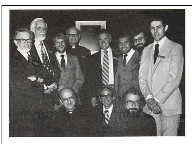
Group of scientists at Brooks Institute

The main target of this article is to provide you a brief description of the history of the CMS (Centro Mexicano de Sindonologia) as brief as possible in order to celebrate the XXX Anniversary of its founding