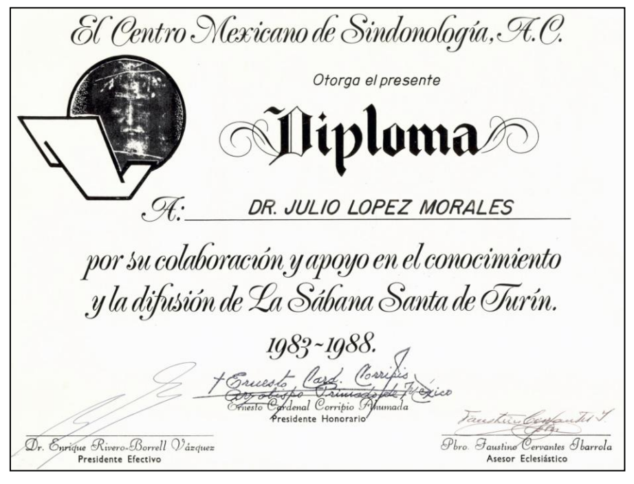
1988 - V Anniversary of the CMS. Mass and presentation of diplomas.

On the occasion of the Marian Year in 1987, the CMS was devoted to the Blessed Virgin Mary with a Mass in the Basilica of Guadalupe.