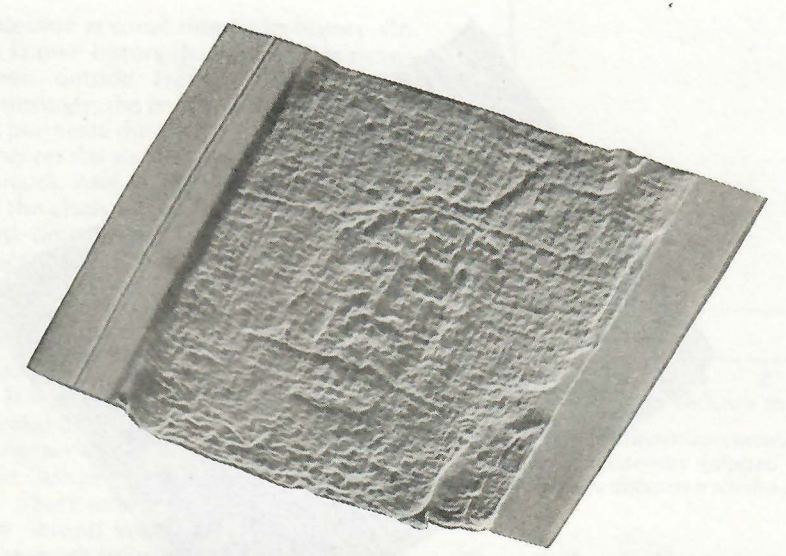
Figure 5. Three-dimensional image of the face with the relief adjusted to call attention to the button-like objects on the eyes, the object on the right eye being the most noticeable.

Shroud images, we obtained the results shown in Figs. 3 and 4. I think you will have to agree that the distance information encoded into the image is so uniform and regular that a well proportioned three-dimensional image of the man of the Shroud can be seen. We call this property of the Shroud its "three-dimensionality."