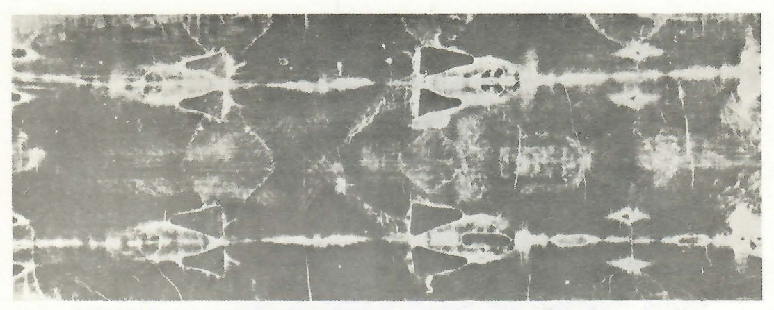
Figure 1. The Shroud of Turin: The front image in negative showing the "positive" image first discovered by Secunda Pia in 1898.

sion, made many observations about the characteristics of the image, the most important being that the image seemed to be present even where the cloth could not have been in contact with the body. After investigating many possible causes for the image, Vignon decided that the process must have been the vaporization of body excretions. Through a diffusion process, these vapors eventually made contact with the cloth and stained on the image visible today. Modern science, however, has great reason to doubt this process as the one involved.