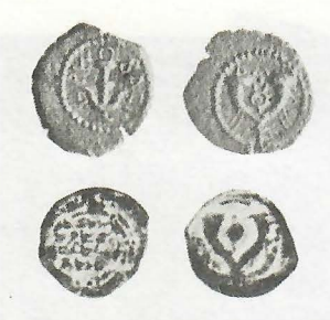
Other possibilities are a Judea bronze lepton of Herod the Great 37-4 B.C. or a Judea bronze lepton of Judas Aristobulus, 104-103 B.C. Can numismatic students of the period think of others?

prevented work. This practice kept the eyes from opening due to rigor mortis and therefore negated the necessity of closing the eyes, which was considered work.)