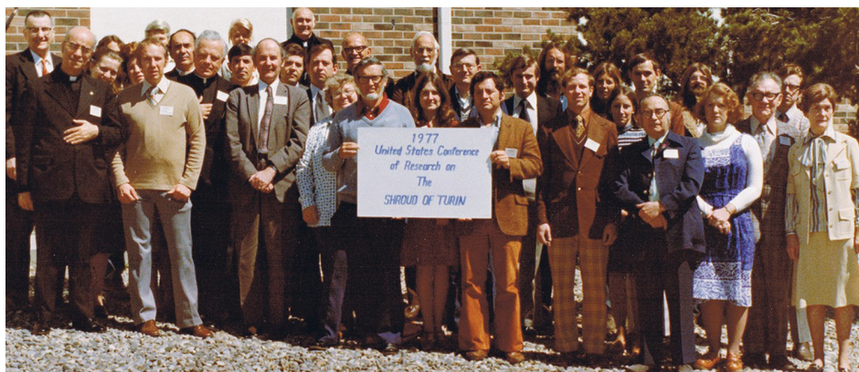
In the beginning...