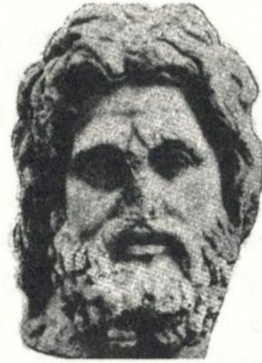
Head of Christ; from Gerasa; dated btwn. A.D. 200-500