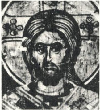
Christ wearing a dalmatique; Macedonia; XI th or XII th c.