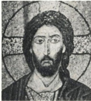
Christ Savior of Souls; icon produced in Constantinople, XII th c.