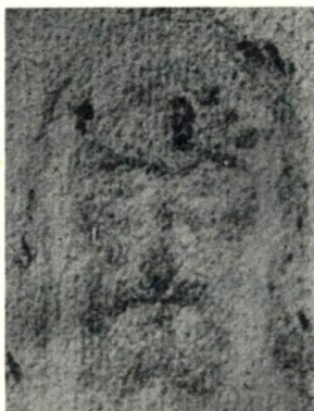
Reffo copy, Turin, 1898