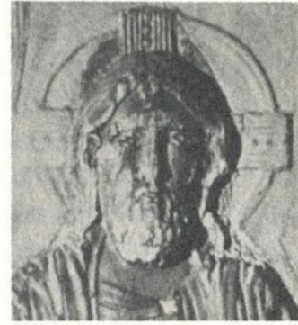
Christ Pantocrator; Byzantine, IX th c.

This type continues in the several Beaux Dieux of France and the Burgundian School of Claus Sluter, both XIV th c.