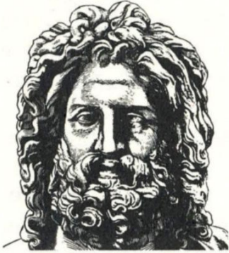
Zeus; excavated near Terni; Vatican Museum