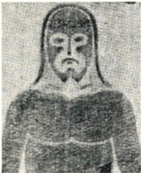
Chambéry, France, XVII th c.