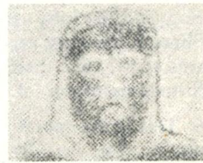
Bologna, Italy, mid-XVII th c.