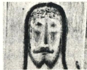
Alcoy, Valencia, 1571