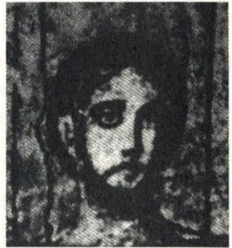
Young Moses, Dura-Europas Synagogue, III rd c.