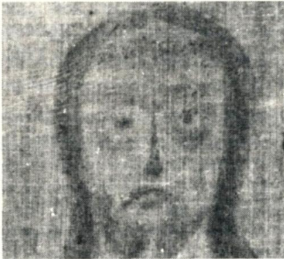
Lierre, Belgium, 1516