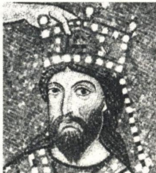
King Roger being crowned (face is reversed).