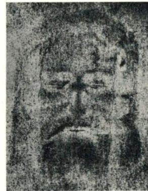
Cussetti copy, Turin, 1889