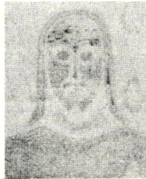
Moncalieri, Turin, 1634