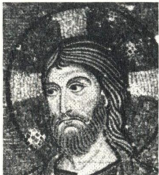
Christ crowning King Roger; Palermo, XII th c.