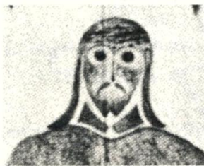
Imperia, Italy, 1678