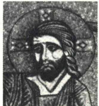
Christ in Limbo, St. Mark's, Venice; ca. XII th c.