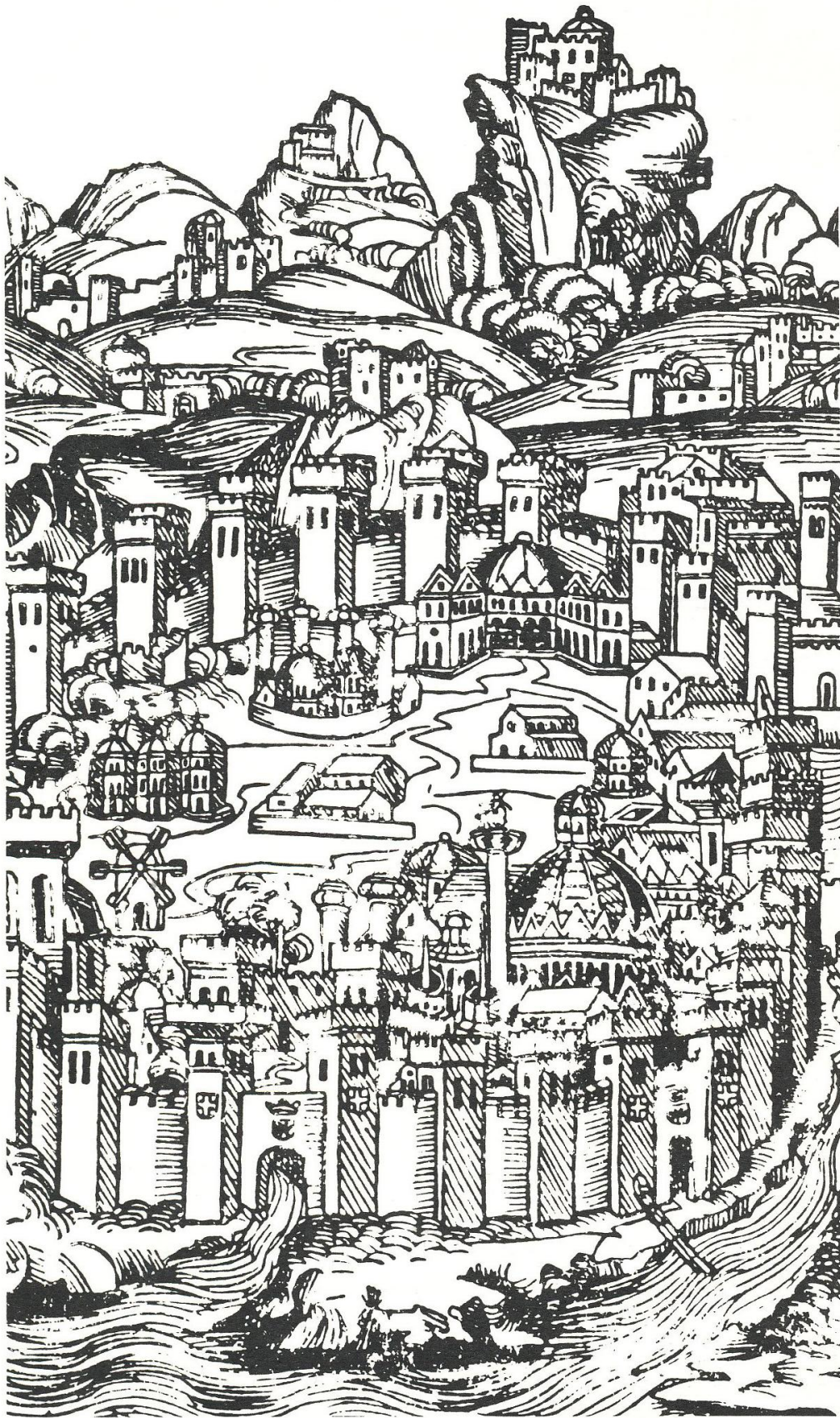
Constantinople before the Latin Conquest.