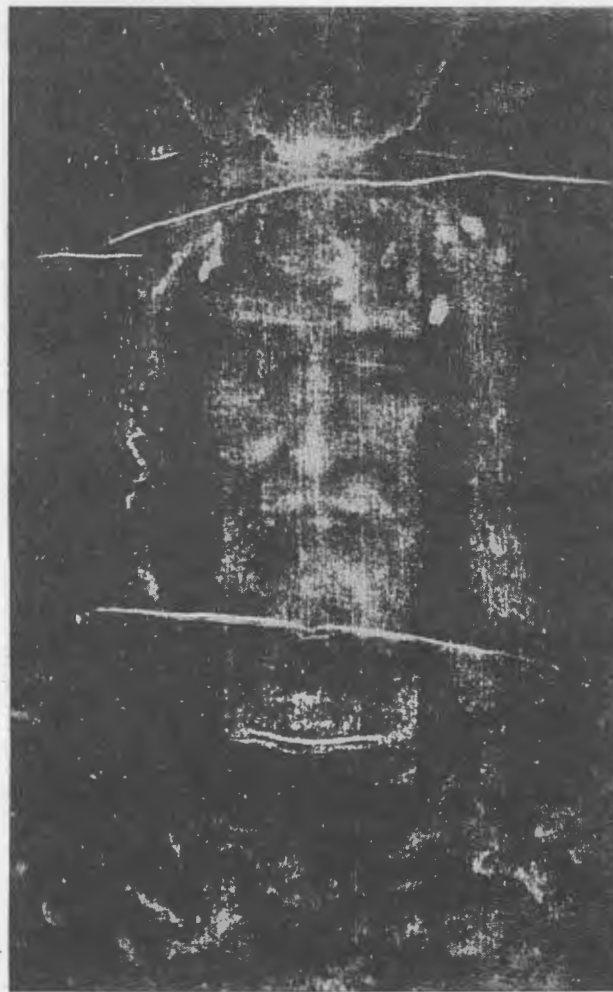
THE HOLY FACE OF OUR BLESSED REDEEMER— A DETAIL FROM THE NEGATIVE PHOTOGRAPH OF THE HOLY SHROUD AT TURIN, ITALY.