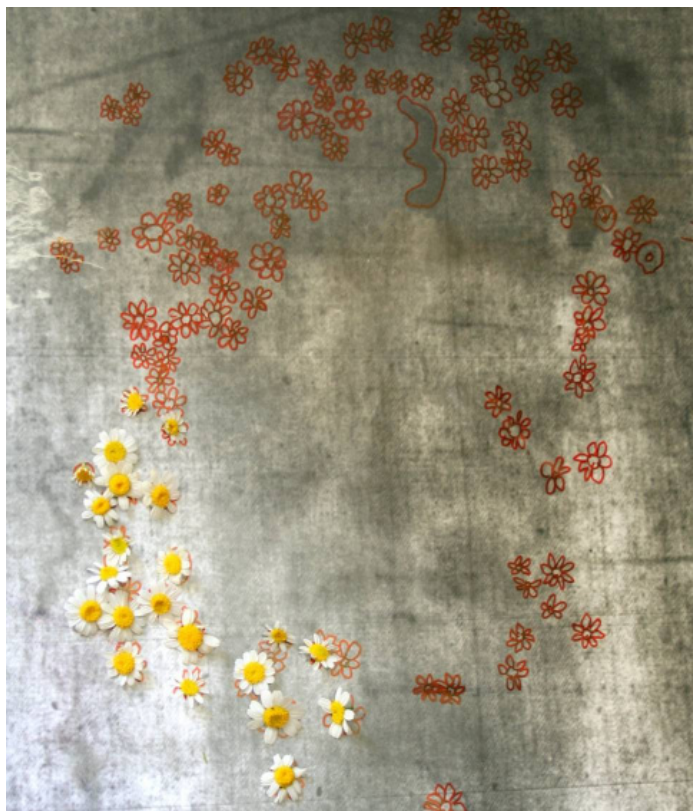
Figure 3. A model reconstruction of the flower-covered head of the Man of the Shroud.