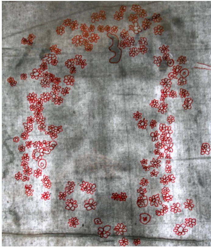
Figure 2. Plant images (mainly capitula) marked on transparent cellophane on a photograph made by Vernon Miller in 1978.