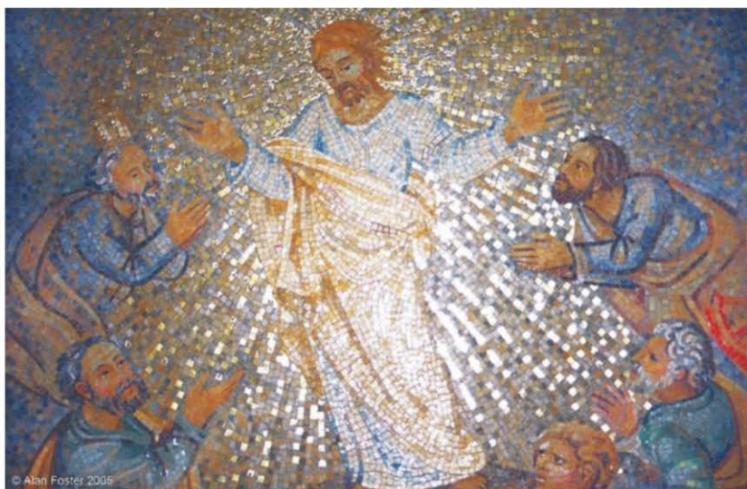
Transfiguration of Christ, St Peter's Basilica, Rome

So, it is not so strange that Jesus - God incarnate, could be adept with this 'Universal Light', and even photograph Himself from past death's gates, and then return to make sure this historic act could be preserved by those who loved Him most. In this context, the period after the Resurrection would be the training, along with the descent of the Holy Spirit at Pentecost, which helped the disciples to continue His work. And importantly, to encourage them to keep the Shroud safe for future generations when science could understand its relevance more clearly. Jesus' Ascension, would be His return to higher planes of existence, reversing His earlier descent into matter, from a realm of pure spirit, energy or consciousness.