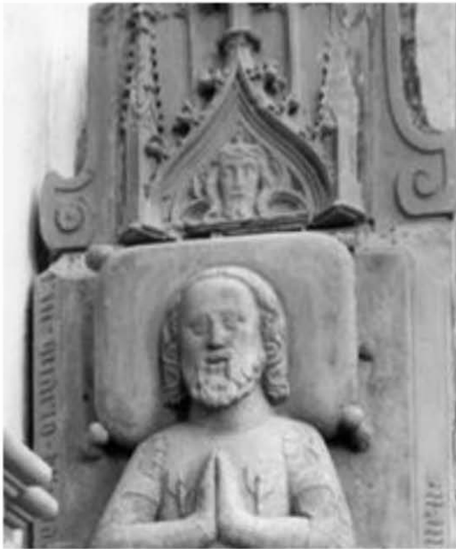
6

spolia and has been dated to the seventeenth century.