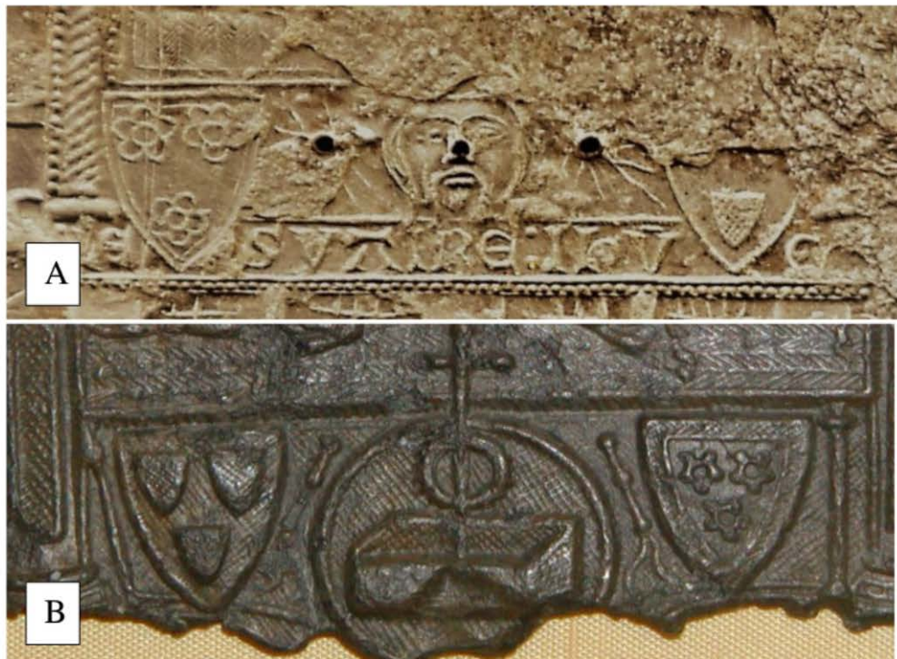
Figure 3 A: Detail of the recently discovered Shroud pilgrim badge mould with the label SVAIRE IhV, this indicating that it was being claimed as of Jesus and therefore produced for the first round of Shroud showings that were suppressed by Bishop Henri de Poitiers. The fact that the Vergy coat of arms (at left), is in what is heraldically the prime position, suggests that Charny's widow Jeanne de Vergy was in charge at the time of these showings, Charny himself being deceased. The likely date for these showings (and accompanying badge), is therefore circa 1357/8. Figure 4 B: Equivalent detail of the Shroud pilgrim badge proper that was found in the mud of the river Seine in the mid-nineteenth century. In this instance the Charny arms are in the prime position, it arguably being Charny's son Charny II who was in charge of these showings (as he is known to have been in 1389), his pairing of his arms with those of his mother being in her honour. The lost inscription to the badge, thought to have been on a banner the top corner of which is just visible below the point of the Charny shield, probably carried the single word SVAIRE.

As my recent researches of his biography have made clear, he enjoyed perfectly cordial relations with two popes, Clement VI (pontificate 1342-52), and Innocent VI (pontificate 1352-62), both of whom complied readily enough to the various minor devotional requests that he put to them. As a member of France's royal council, he regularly rubbed shoulders with archbishops and abbots, and was thereby well placed