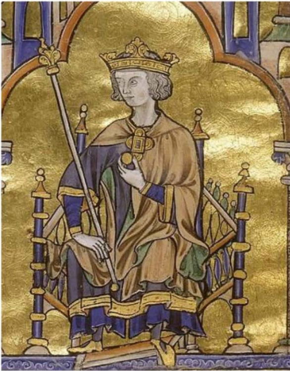
Figure 2: St. Louis, king of France, from a section of so-called Moralized Bible of St. Louis held in the Morgan Library, New York (MS M.240). Unlike Charny at Lirey, St. Louis formally installed, and ordered security for, the relics that he housed in the Paris Sainte Chapelle .

In order that these [the Chapel's sacred relics] should be continually revered with divine praises ... we wish, we institute, and we decree that this same Chapel shall have five principal priests or senior chaplains.