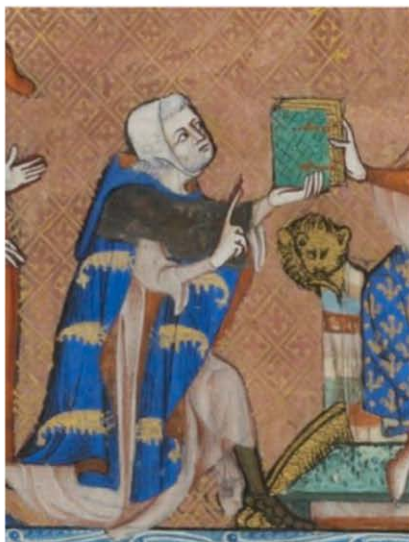
Figure 2: Charny's grandfather Jean de Joinville, who followed the correct procedures when he installed relics in his family church. From BnF MS fr. 13568, f 1

Lest it be supposed that the Shroud had been acquired by Charny perhaps after the drawing up of the Act, its omission from inclusion in its provisions therefore having been a simple accident of timing, this again is not borne out by the documentary evidence. Whilst it is true that the Act was drawn up at Lirey on 20 June 1353, three years before his death, this was merely the start of the long-drawn out legal process that French law required for a church foundation, that for the Sainte-Chapelle having