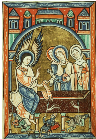
Ham of Fecamp 1180 ( manuscripts.kb.nl )