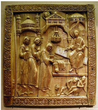
Anonymous 1140 ( mariamagda.free.fr )

The principal discussion forum on the Shroud, shroudstory.com , has been as active as ever, with particular emphasis recently on Charles Freeman's History Today article, but with some detailed discussion of various old topics, which, although they inevitably involve a certain amount of restatement of position, often bring out new aspects and inspire new research. Ironically, in view of later events, the early Summer was spent relating the famous Pray manuscript to the iconographic tradition of