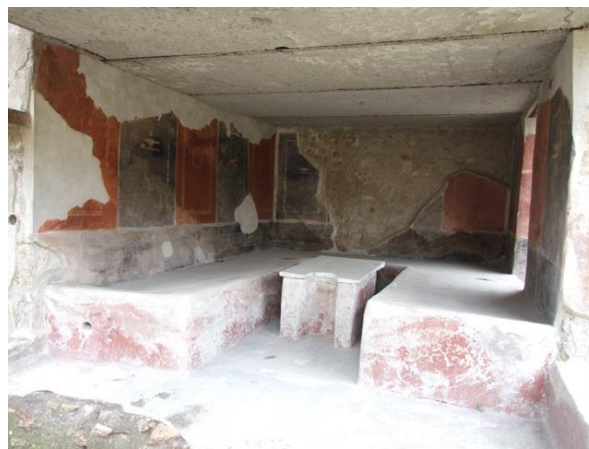
Two examples of the remains of a triclinium at Pompeii

The safest way to judge the dining of the first century is to employ archaeology and stick to the murals found in Pompeii. Tables with wooden legs were burned due to the volcano in 79 AD (Pompeii & Herculaneum) and the ravages of time wherein organics—such as wood, cloth, and other perishable items—and are no longer available to give us a truly accurate picture of dining in the first century.