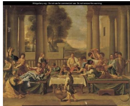
Sacrament of Penance by N. Poussin

the artist has used artistic license in depicting the table cloth, the vessels and utensils. Even if one keys into the computer "triclinium" one must use the finds critically. When we look at what has been preserved we notice that in the actual structures, the tables are small, and in the murals they are never depicted with cloth coverings.