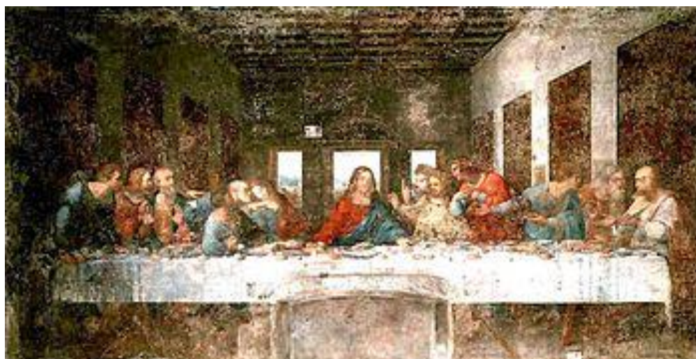
In Da Vinci's portrayal, the table cloth is quite prominent

By far, the most famous artist illustrating the Last Supper, is Leonardo Da Vinci. One can see the visuals in that meal including the prominently displayed table cloth on which the utensils and vessels are placed. The re-enactment works perfectly for our purposes because each "actor" is able to get up, look at the one playing the role of Jesus, and yet still face the congregation, and give his entire presentation as if he were on a stage with all its props.