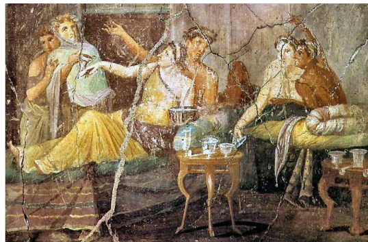
The Feast of Trimalchio, wall mural, Pompeii

The safest way to judge the dining of the first century is to employ archaeology and stick to the murals found in Pompeii. Tables with wooden legs were burned due to the volcano in 79 AD (Pompeii & Herculaneum) and the ravages of time wherein organics—such as wood, cloth, and other perishable items—and are no longer available to give us a truly accurate picture of dining in the first century.