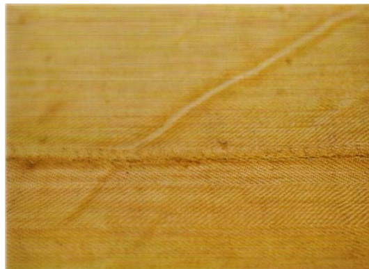
Fig. 3 & 4 The Shroud's seam has been folded onto and sewn from the reverse side so it appears flat and hardly noticeable on the front side.

As seen in Figs. 3 and 4 below, this long seam has been carefully folded onto and sewn from the reverse side of the Shroud so it appears flat and hardly noticeable on the front side. This also causes the reverse side to have a raised or rolled effect that is noticeably similar to the hems of cloths found in the tombs of the Jewish fortress of Masada destroyed in 73 A.D. 3