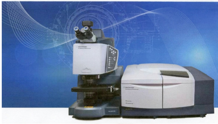
Fig. 5 Cary 620 FTIR microscope and imaging system.

However, it would have been quite difficult to examine a cloth 14' 3" long and over 3 ½' wide (4.34 m x 1.10 m) with such a small viewing mechanism as found with the FTIR microscope above. This problem has now been completely resolved with a version of hyper-spectral imaging seen in Fig. 6 below.