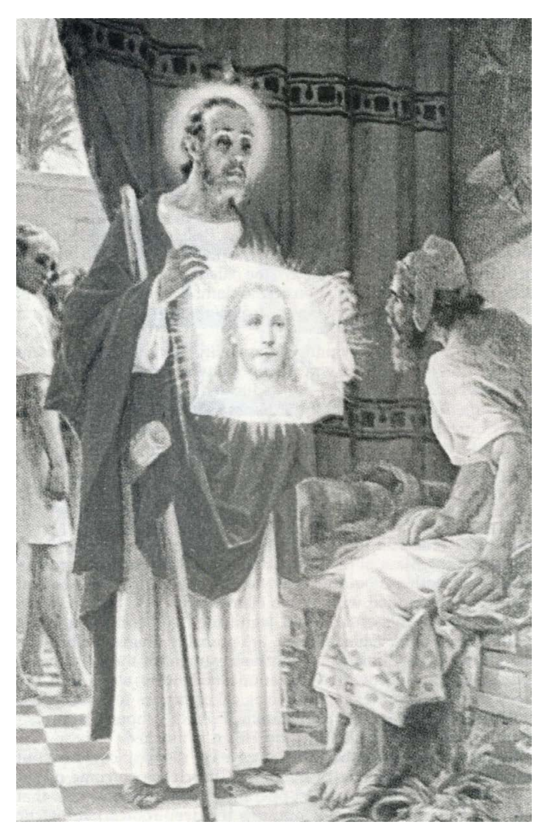
Figure 3: St. Jude Thaddeus displays the Face of Christ to King Abgar, who is thereupon cured of his disease. The golden-haired Image is brilliant with light. The XIX<sup>th</sup> century painting hangs above the altar in the Carmelite church of St. Jude Thaddeus, Rome.