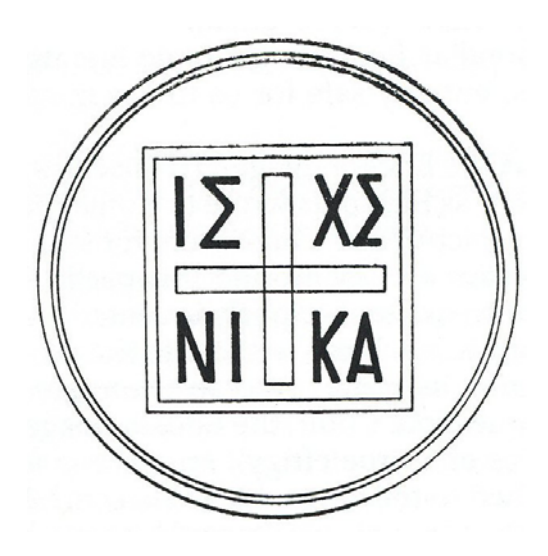
The prosphore, or Eucharistic bread.

The cross signifies that I was attached voluntarily. The first line shows that I am not only an ordinary man, but also perfect man and perfect God. Line 2 means that I lay myself down upon [word(s) missing]. The third line signifies that first of all I am God and that outside of me there is no other. Line 4 shows that I am a powerful king and the God of gods. Line 5 means that I was the Savior of all mankind. In its totality, [the talisman] signifies that I live entirely and eternally and that I endure and reign now and forever. Amen.