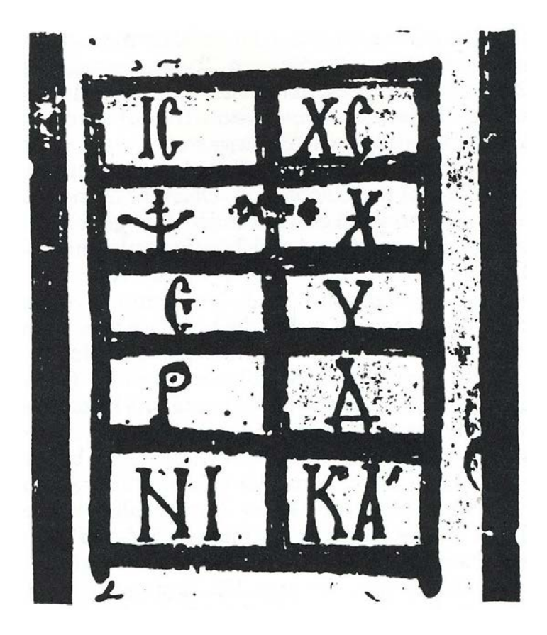
Fig. 4: The Talisman. Jesus' explanation of his acrostic:

The cross signifies that I was attached voluntarily. The first line shows that I am not only an ordinary man, but also perfect man and perfect God. Line 2 means that I lay myself down upon [word(s) missing]. The third line signifies that first of all I am God and that outside of me there is no other. Line 4 shows that I am a powerful king and the God of gods. Line 5 means that I was the Savior of all mankind. In its totality, [the talisman] signifies that I live entirely and eternally and that I endure and reign now and forever. Amen.