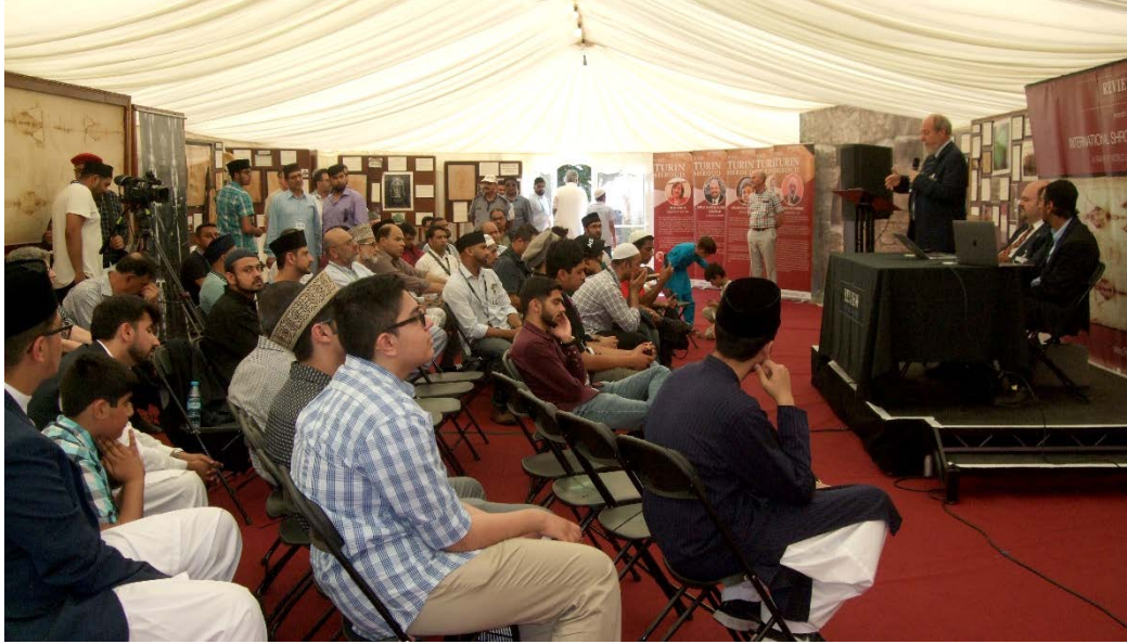
Review of Religions Shroud Conference and Exhibit Marquee