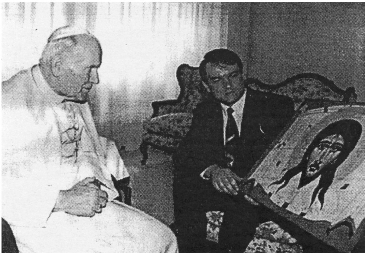
Pope John Paul II receives a gift of an icon from Polish Prime Minister Waldemar Pawlak. The icon bears many of the Shroud features.