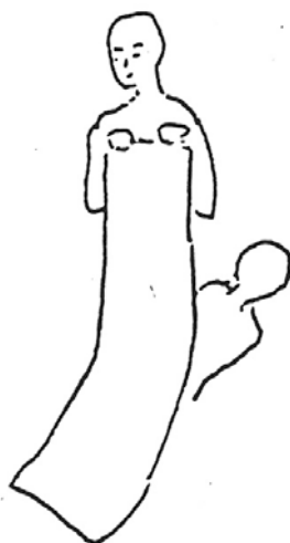
Left: recumbent figure with Shroud partially removed

One of the churches the Hope Simpsons came across was that of St. Gregory of Tigran Honentz, dated c.1215. Just above eye level on the liturgical north wall they noted what would seem to be an iconographically unique mural, featuring, according to their own description: "a shroud being removed from the body of Jesus and then being displayed with the face and clothing, full length, marked on it"