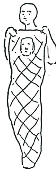
Right: person holding Shroud in shape of swaddled human figure. Face visible, but no arms or legs shown, Note faint trellis or grid pattern

Unfortunately Ani is literally on Turkey's frontier with Russia, and at the time of the Hope Simpsons' visit they were not allowed cameras, binoculars, or even a notebook. Furthermore they only noticed the painting shortly before their military escort asked