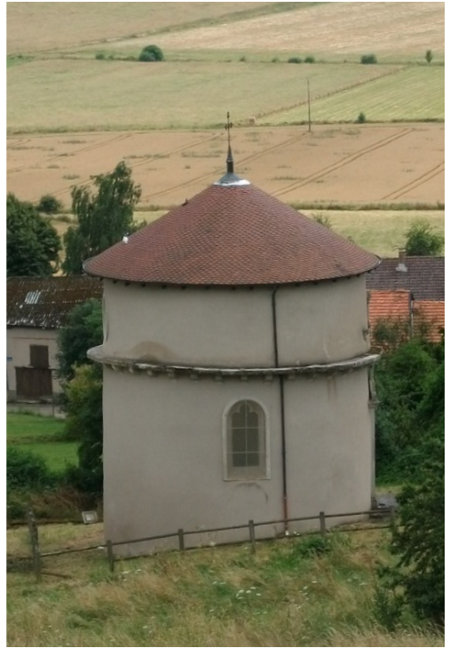
The Bauffremont Chapel in a 19 th century postcard and today.

chapel dedicated to St Joseph (see the old postcard above) and it also became the official parish church of the village. This fact was only rediscovered when the village wanted repairs to their supposed parish church, only to find, when the records were checked, that it was the dove tower that was officially registered. So their request was rejected and no central funding was given for the 'false' parish church! There was also originally another chapel within the grounds of the castle (the 'église castrale' marked 'F' on the drawing opposite), but it no longer exists. If the Shroud did stay at the castle during the period 1400-1415, then this chapel would have been a very likely place to have housed the relic. The 'colombier' chapel is marked 'G' on the drawing.