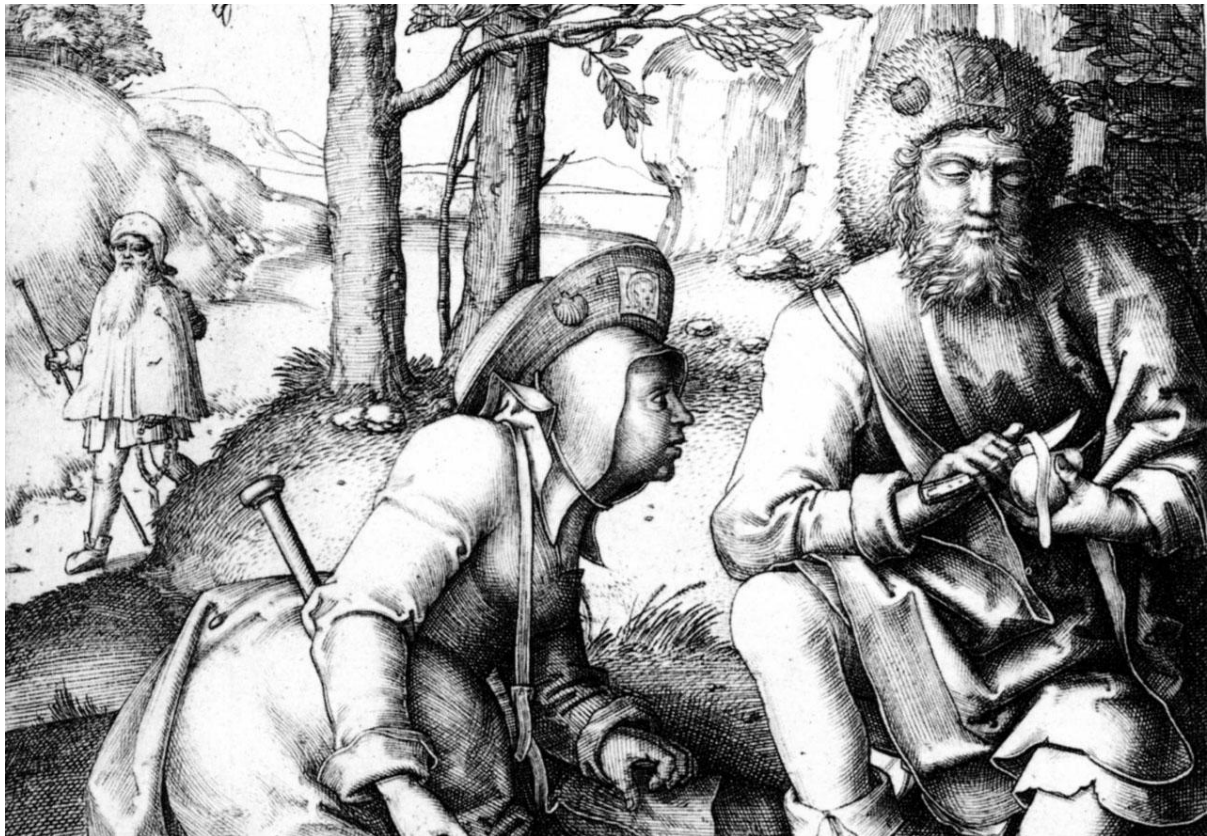
Figure 1 - Pilgrims resting by the wayside, by Lucas van Leyden (1494-1533). Engraving in the collection of the Museum Boijmans van Beuningen, Rotterdam.