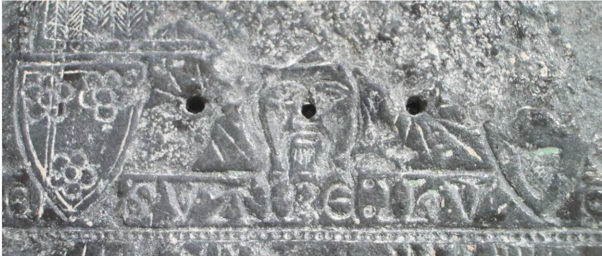
Figure 7 - Detail of the Machy mould showing the disembodied Christ face on a landscape background, flanked by what seem to be two stars. This too has been mirror-reversed to show the image as it would have appeared on an actual badge.

On the Cluny badge we see immediately below the depiction of the exhibited Shroud a roundel with Jesus' empty tomb, accompanied by implements of the Passion such as the crown of thorns, the scourge, the cross, the spear, etc. On the Machy mould, however, none of these items are represented. Instead there appears solo what can hardly be interpreted other than as the face of Jesus (although notably without halo) on a landscape aspect background, flanked at either side by a vent hole with striations radiating from it. Although vent holes were technically necessary in badge moulds for the badge's casting from hot metal, the placement of this particular pair, each with radiating surround, suggests that the artist may have intended each hole to double as the body of a star, the radiating striations being the star's rays. [fig 7]