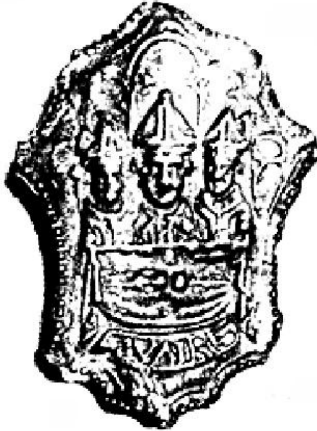
Figure 6 - Mould of a Shroud pilgrimage badge in the collection of the Brussels Bibliothèque Royale, featuring a banner bearing the word 'SVAIRE'. From a modern engraving, this has been reproduced here mirror-reversed to convey the appearance of any badge created from it. Although Kunera have classified the mould as from the post-1453 Chambéry period of the Shroud's history, the date is yet undetermined. Kunera object 11140.

Currer-Briggs very confidently stated that the positioning of the arms on the Cluny specimen indicated it to have been created in Geoffroi's lifetime, subsequent correspondence with present-day specialists in the light of the Machy discovery has revealed substantially less certainty. In the words of one, 'the practice of marshalling arms was still in its infancy in France in the fourteenth century, and no clear rules had yet been established.'