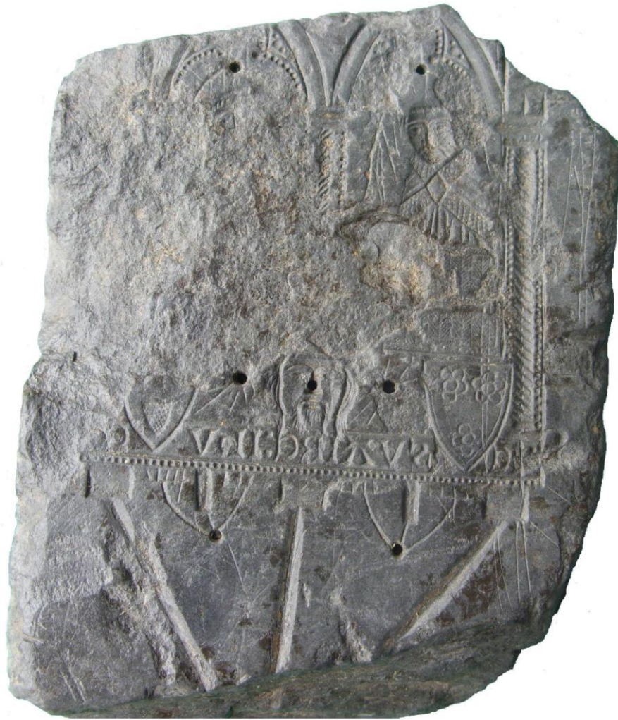
Figure 2 - Actual appearance of the mould found at Machy, near Lirey. Any pilgrim badge created from this would of course have been in mirror reverse, as in the reconstruction featured in Fig. 3.

Now not least of the fascinating aspects of our now having two different versions of souvenir badges created for pilgrims visiting the Shroud at Lirey is that, although both versions have suffered some substantial damage, there survives enough of each for both to be reconstructed with what may be cautiously considered reasonable accuracy. 2 And as can be seen when the two reconstructions are set side by side [figs 3 & 4], although the two badges would have been broadly similar to each other, they do exhibit some surprises and some intriguing differences.