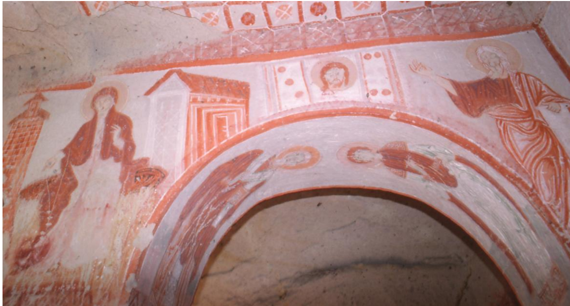
Above: Right-hand archway in the Sakli church, Göreme, showing the Image of Edessa at the apex of the arch, between the prophet Isaiah at right, and the Virgin Mary at left.