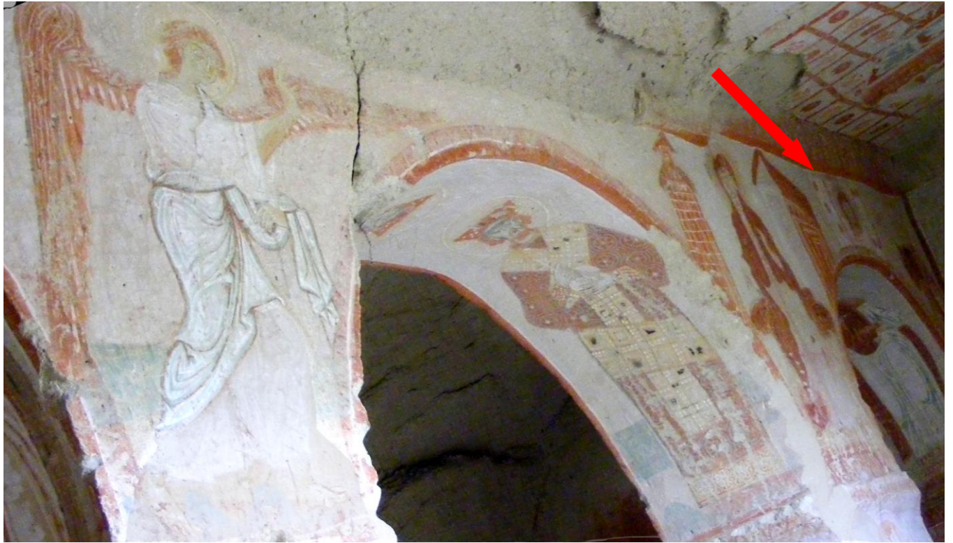
Interior of the Sakli Church, Göreme, Cappadocia, showing the Annunciation scene at either side of the central archway. The Image of Edessa can just be seen (arrowed in red) at the apex of the second, right-hand archway. Below right: detail of the Virgin Mary from the same scene.

direct or indirect, of the image on our Shroud?