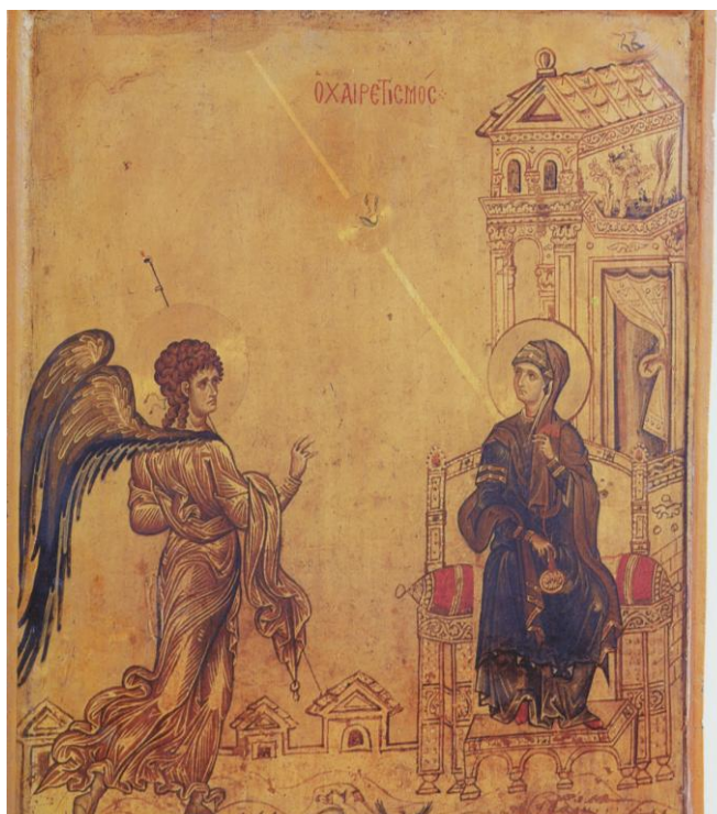
Above: icon of the Annunciation, St.Catherine's Monastery, Sinai; Below: Detail of the same, showing faint 'imprint' of the Christ child in embryo on Mary's chest, at the end of the golden beam of light running diagonally from the top left.

But look closer – a lot closer - at where the shaft of light ends at Mary's robe. Vanishingly faint there can just be discerned the ghost-like figure of the Christ child being imprinted in Mary's womb. OK, it's Christ at the very start of his life, in embryo, in the womb, rather than at the very end of his life, covered in mortal wounds, in the tomb, as seen on the Shroud. But in the entirety of Byzantine art no other image get us closer to the shadowy, ghost-like character of the imprint that is still to be seen on Turin's Shroud. So could the artist who created the St.Catherine's Annunciation have been displaying some awareness