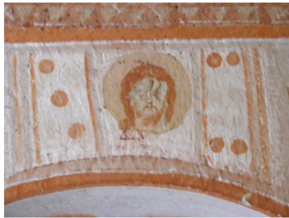
Right: Detail of the Image of Edessa fresco