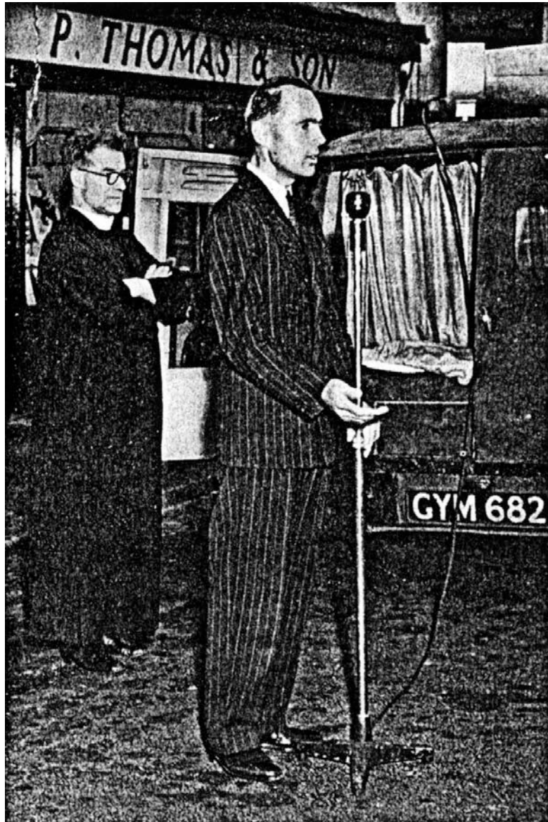
AT TRURO, CORNWALL, 1952