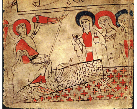
11th Century depictions of the Three Marys showing the skewed slab. The one on the left includes Quem Quaeritis text.